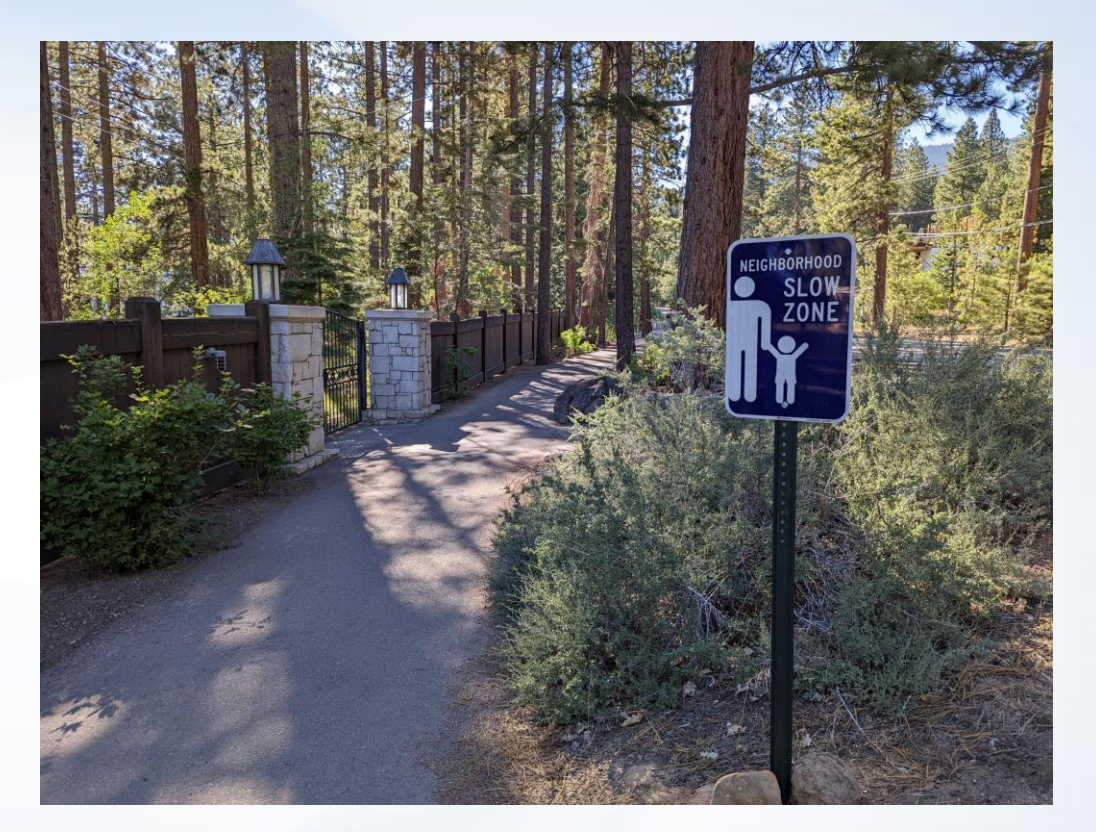
Slow Zone signs installed on Lakeshore Path (2022)